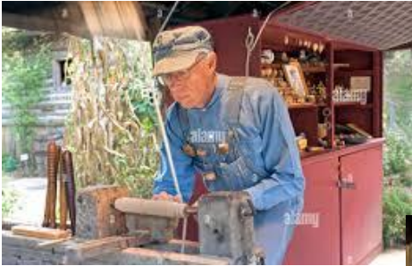
Ozark Folk Center- Various artist demonstrating their trades. Items available for purchase. Lots of Mountain Folk Music.