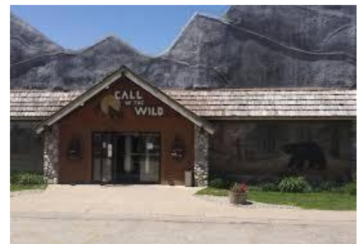
Call of the Wild Museum