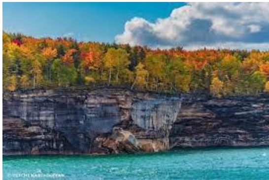
Pictured Rocks Cruise