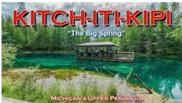
Palms Book State Park