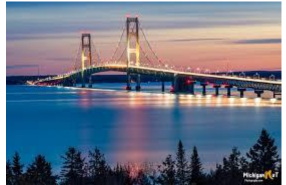
Crossing the Mackinac Bridge