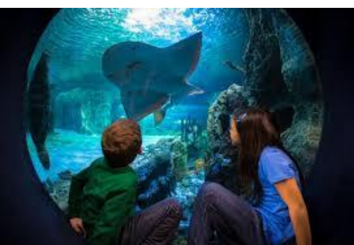
Note: There is a lot of walking on this tour.

$950 pp double occupancy$1200 single occupancy$860 pp triple occupancy$825 pp quad occupancy