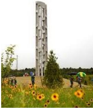
93 Flight Memorial