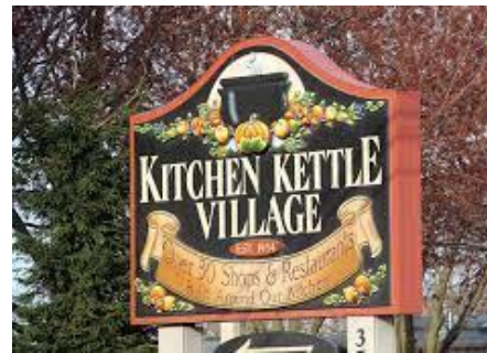
Shopping, Amish Products Unique Experience