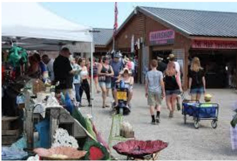
Shipshewana Flea Market